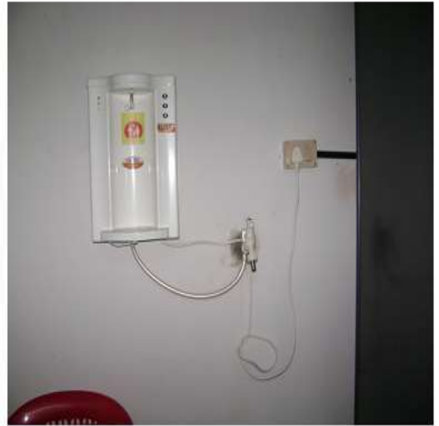
Autoclave, Aqua guard purchased through Untied funds