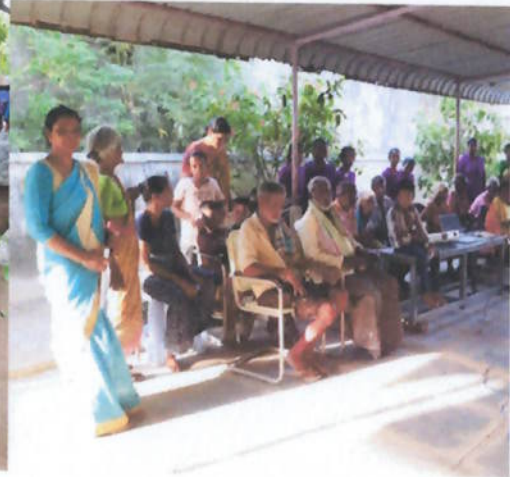
Health Awareness Camps