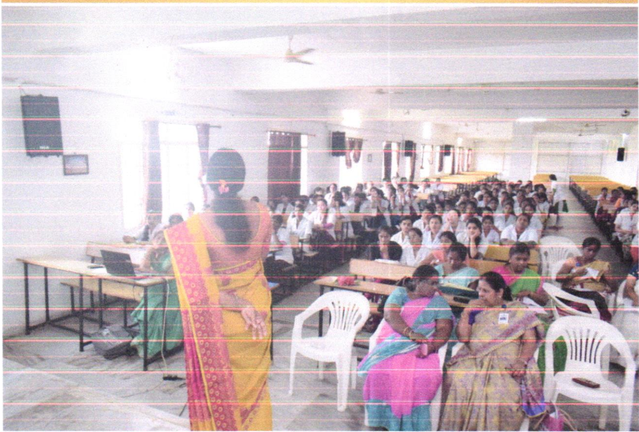
Awareness on Library Usage on ILMS