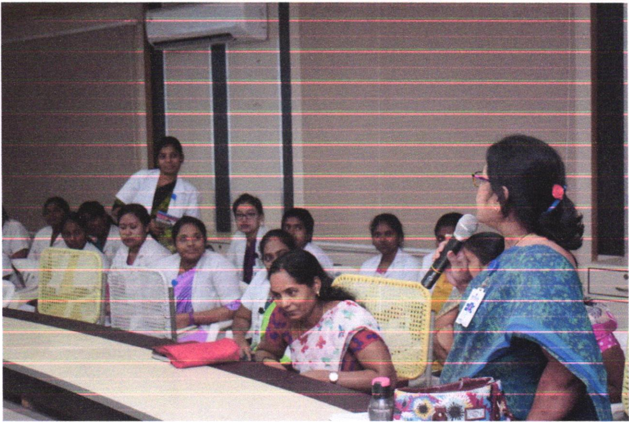
Awareness on Library Usage on MOOC