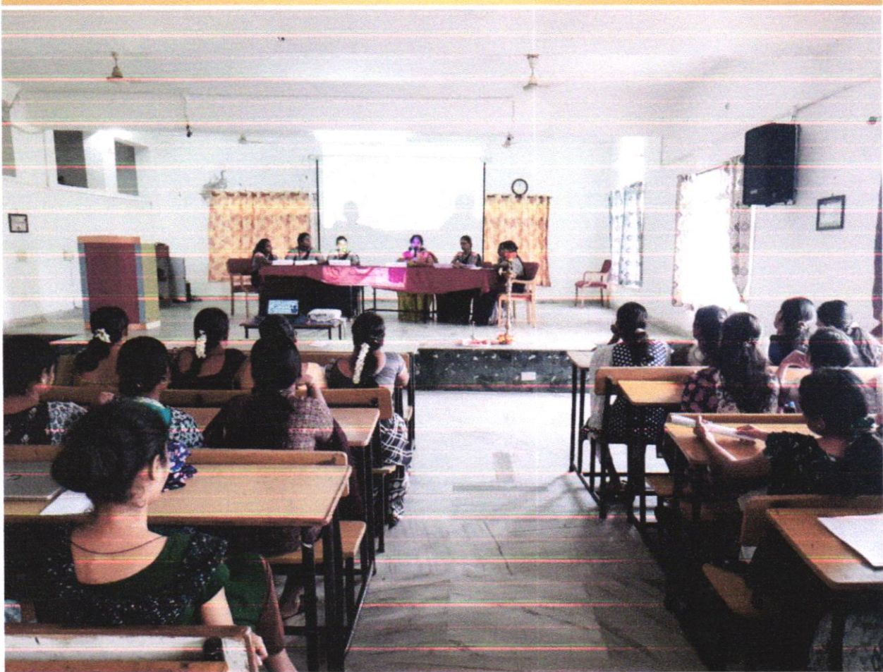
Awareness on Library Usage on SWAYAM